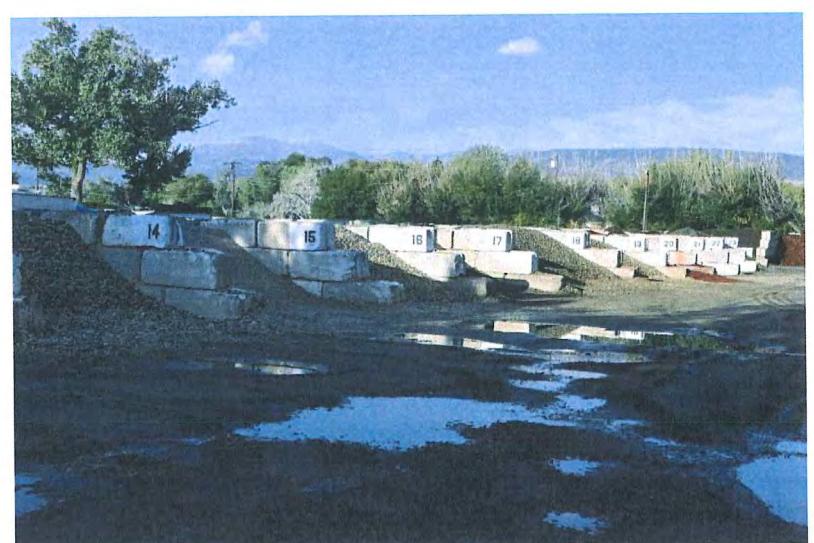
Storage bins surrounded by damp soil at GWL's current location.