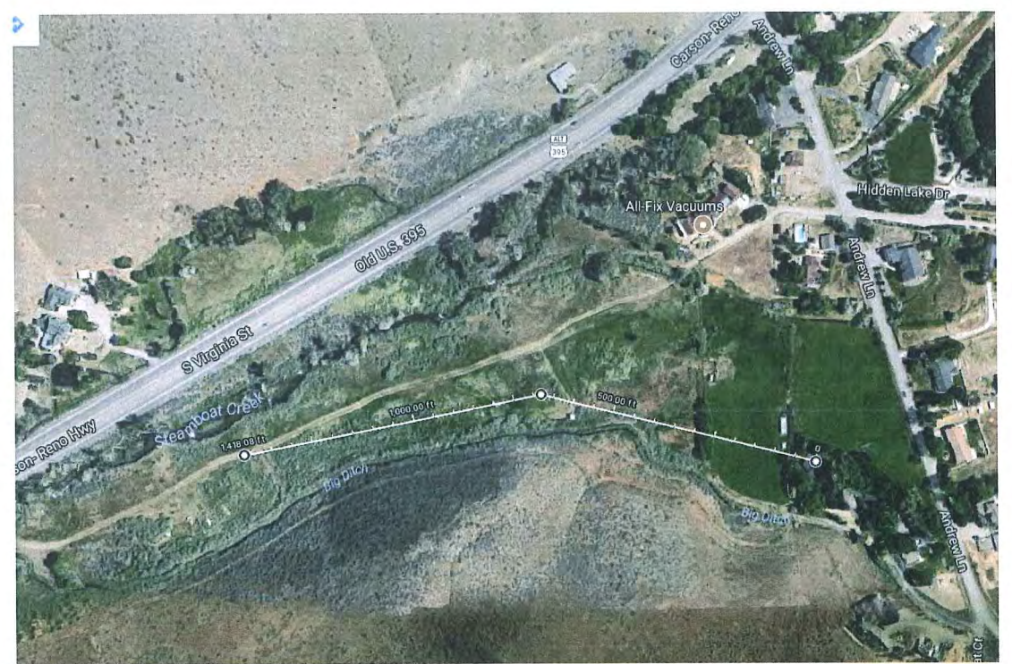
Colorock activities will be 1,400 feet from the Greenhalgh Family Trust residence.