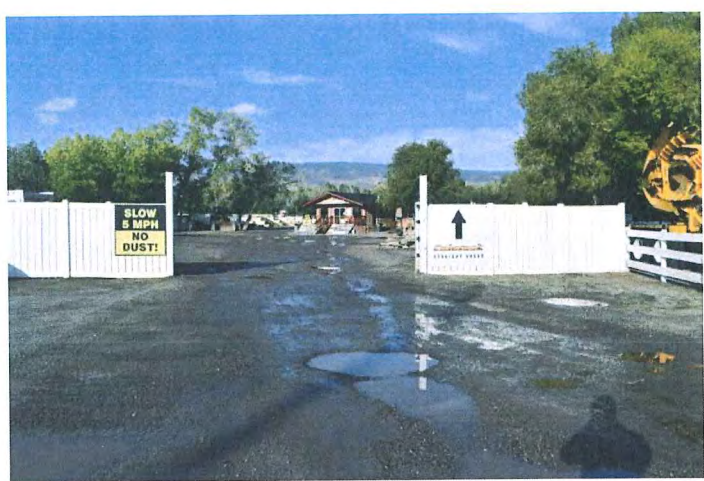
Clearly posted speed limit and "NO DUST" sign and damp soil at GWL's current location.

been cited for dust or debris by the City of Reno and will continue to maintain its strict "no dust" policy.